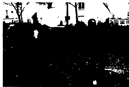
Protests in Paris following a demonstration, 2006

The braiding of memory, history, and performance has inspired a number of exhibitions in the past five years, including: A Little Bit of History Repeated at Kunst-Werke Berlin (2001), A Short History of Performance at the Whitechapel (2002, ongoing), Experience, Memory, Reenactment at the Piet Zwart Institute (2004), Life, Once More at Witte de With (2005), Once More . . . With Feeling at Reg Vardy Gallery (2005); Ahistoric Occasion: Artists Making History at Mass MOCA (2006), Now Again the Past: Rewind, Replay, Resound at Carnegie Art Center (2006), and Playback_ Simulated Realities at Edith Russ House (2006). Inevitably, each of these exhibitions sang from the same hymnal and catered to roughly the same roster of contemporary artists. However, the artist's intention in each artwork is strikingly unique and often deeply personal. These differences help to unbalance and challenge notions of the past, history, simulation, reproduction, and repetition that have been used to curatorially bind these works. 32