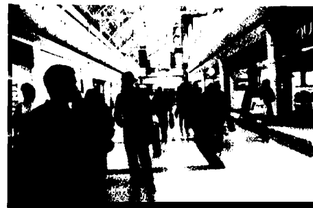
Shopping center

"Lost in the Mall" was a false-memory experiment devised and carried out by Dr. Elizabeth Loftus and her students from the University of Washington. Her findings, published in 1993, charted the implantation of false memories in twenty-four individuals. To create the experiment, Loftus made a booklet for each of the participants. Inside the booklets were four descriptions of memories; three of the stories were of real childhood memories provided by the participants' families, and the fourth was a false memory of being lost in a mall. After the participants were invited to the lab to read their respective booklets, they were asked to elaborate on the memories with their own recollections, and if they had none, to simply write, "I don't remember this." What was perhaps more surprising than the statistically significant figures culled from the experiment was the degree of detail with which the false memory was confabulated.*