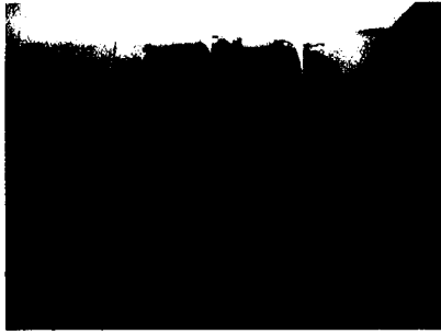
Peter Richards, Live, Live Art Histories , 2004, pinhole photograph of live collaborative action, duration 6 min., approx. 13 ft. 8 in. x 7 ft. 4 in. (420 x 220 cm), Cornerhouse, Manchester, United Kingdom (artwork © Peter Richards)

In 2004, the artist Peter Richards created Live, Live Art Histories , a work that ingeniously illustrated a relationship between documentation and the performative act. Exploiting the fact that both pinhole cameras and performance art are “time-based media,” Richards created a roomsize camera obscura. The audience of the “performance” was invited inside the camera, and its actions and impromptu performances were emblazoned on a wallsize sheet of photographic paper. This documentation of the human performance (compounded by the performativity of the gradual photographic-development process) was then installed in the gallery.