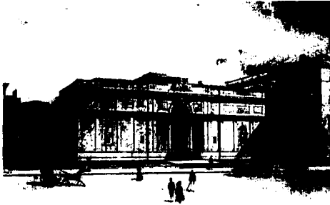
Office of McKim, Mead, & White, architects, Perspective of the Proposed Library of J. Pierpont Morgan, ca. 1905, watercolor. Collection of the Pierpont Morgan Library, New York.

Concurrent with the trend of historicism came the opening of many personal collections of art and artifacts as public museums. The grandest American donor memorial was the neoclassical Pierpont Morgan Library in New York. Morgan, it is largely assumed, considered the library his personal (and public) memorial and wanted it built to last. "The most notable fact about its structure is that the marble blocks that form its supporting walls are, like ancient Greek temples, precision cut to fit together without mortar. . . . As one of his biographers wrote: 'It would put him one up on the Medicis, the Sforzas, the builders of Mont Saint Michel and Chartres, and far beyond the local grandees with their Fifth Avenue palaces all bonded with concrete.'" 17 *