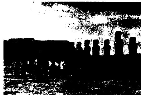
Moai of Easter Island

I once wrote or read (I can’t remember which) that in 1994 a German firm specializing in geological archaeology set out to prove that the monolithic Easter Island figures known as moai came from neighboring Peru. To demonstrate this claim the Germans constructed a Kon-Tiki-esque raft using materials and methods available only to ancient Polynesian craftsmen and ferried a three-ton concrete moai they had sculpted from the Peruvian mainland to Easter Island. However, due to choppy surf the Germans lost their load mid-journey. Undaunted, they attempted to dredge the sunken freight with the aid of a mini-sub. They discovered, buried in the silt of the ocean floor, their concrete sculpture among sixty-three ancient sunken moai figures.