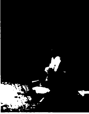
Yoko Ono, Cut Piece, 1965 performance at Carnegie Recital Hall, New York

In 1965 Yoko Ono performed Cut Piece at Carnegie Hall as a largely unknown artist in the Fluxus movement. Looking back at the Maysles Brothers' documentary film of the performance and the degrading way in which many of the men viciously engaged in the piece, she subsequently said that she performed the work with anger in her heart. Her feelings toward Cut Piece changed, however, and in a 2003 reenactment of the performance, staged at the Ranelagh Theatre in Paris, she altered the work to signify a gesture of world peace in the aftermath of 9/11. Each of the two hundred audience members was invited onstage to cut a piece from Ono's clothes no larger than a postcard and mail it to a friend as a show of peace. The element of public offering introduced by this new version of Cut Piece not only allowed the artist's intention to change, further developing the work, it stretched to allow contemporary historical events to alter its meaning for both the artist and its audience-participants.