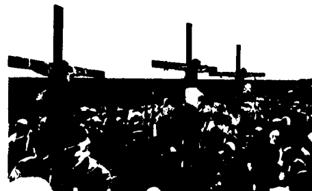
Guagua crucifixion, 2003